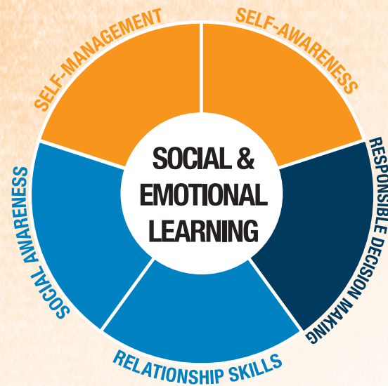
Image from CASEL (2013), Effective Social and Emotional Learning Programs, Preschool and Elementary School Edition .

Students are taught positive interpersonal skills and intrapersonal emotional intelligence using various combinations of media, including videos, pictures and text.